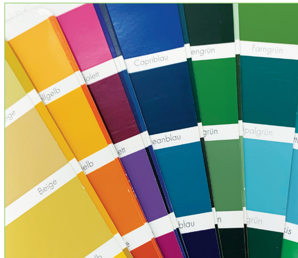
Wide range of colour options